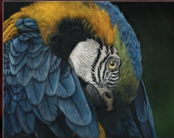
© Cathy Sheeter, MSA - "Preening Macaw"

Some artists prefer to start with an uninked white panel, rather than black. Dark or colored paint or inks are added by the artist to the white surface and then it is scratched away using most of the same tools and techniques used by artists working on the black boards. Clayboard works may look different at a glance, due to their lighter or colored backgrounds, but the work is still subtractive, scratching away dark to reveal highlights.