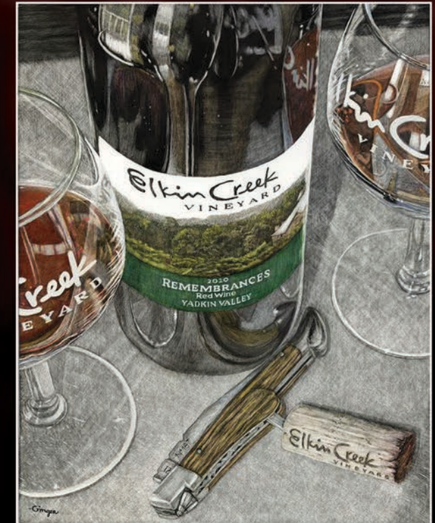
© Ginger Gehres, MSA - "A Moment Shared"

Scratchboard artists use a wide variety of abrasive tools to scratch out different textures in the artwork, including x-actos, scalpels, tattoo needles, sandpaper, steel wool, erasers, and fiberglass brushes.